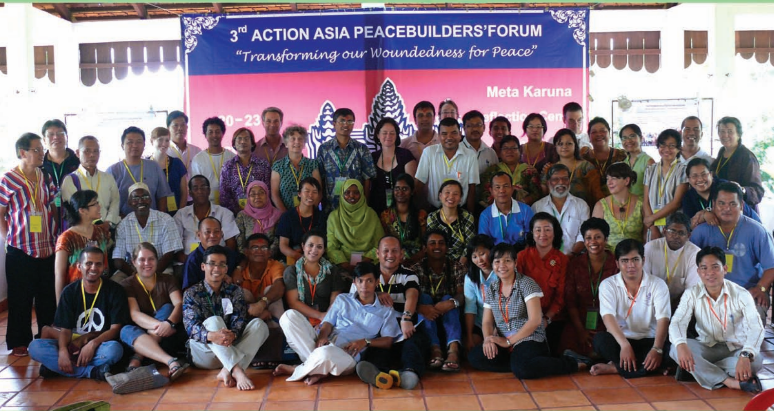
Participants in the 3rd Action Asia Peacebuilders' Forum