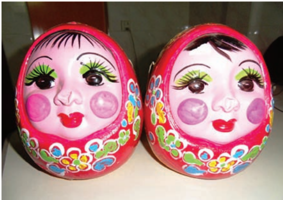
The 'resilient' Burmese dolls

through the village barefoot. He observed that the labourers on the sugar plantations had to drink from coconut shells, and he was shocked by the abusive language used by a child to an elderly man. He observed the disparity between the high and low caste and the impact of this made a deep impression.