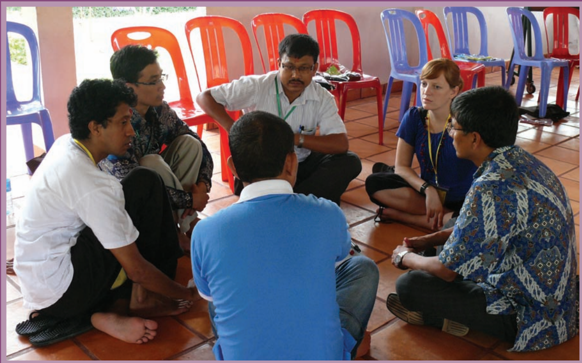
Small group sharing during the Forum

We have seen that awareness of the wounds of the situation may be hidden, internalised, partial, realised gradually or with devastating traumatic events.