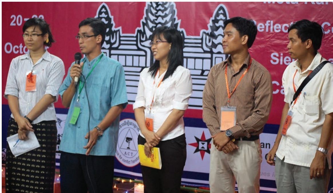
The host team from Alliance for Conflict Transformation (ACT)