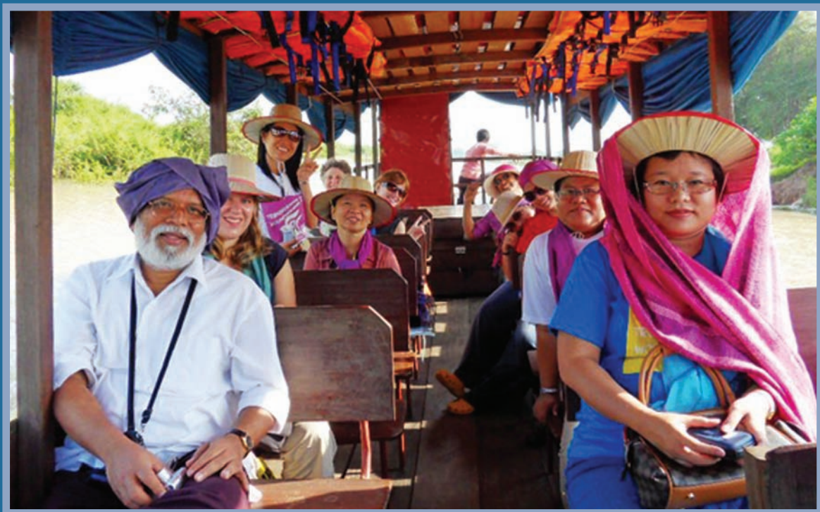
One group on their way to “Flooded Forest” exposure visit

Transforming our woundedness is a journey rather than a destination. The work described in the previous chapter sets out the initial stages of awakening awareness and then, with realisation, comes response. These responses are very varied, shaped both by the political context and also the personal characteristics of those concerned. These approaches may change over time as we gain a broader understanding or as the situation itself changes.